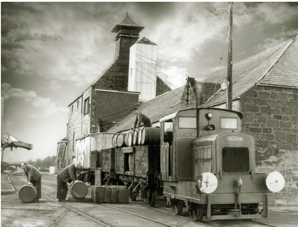
The skill, knowledge and experience that has gone into the making of BenRiach, is testimony to the many years stretching back to the 19th century during which the distillery built its reputation. Few distilleries in Scotland hold such a history and few today can have quite such an exciting future.

Distillery Facts: BenRiach's capacity is 2.6 million litres of alcohol per annum